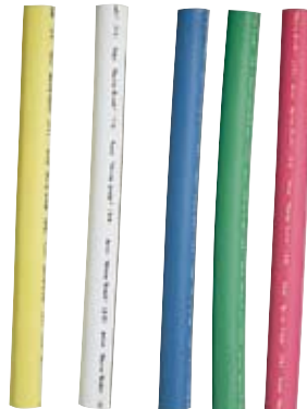
Item Number 304506