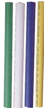
Item Number 306506