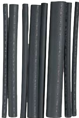
Item Number 301506